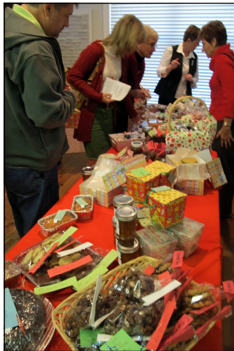
Nothing Half Baked Here: A magnificent display of cakes, pies, cookies, candy and preserves were offered at the Bake Sale Dec. 18